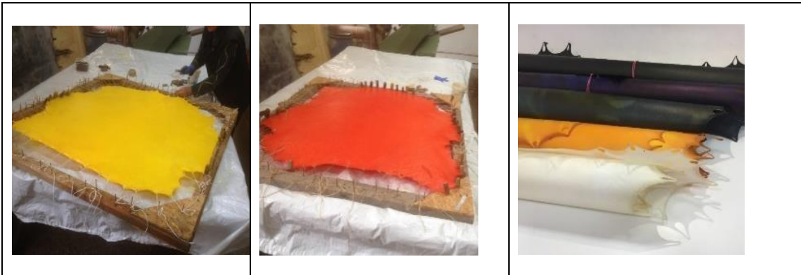
Fig. Coloured and nativ parchment -