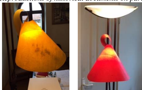
Fig. 5 Coloured parchments used for lampshades / floor lamps