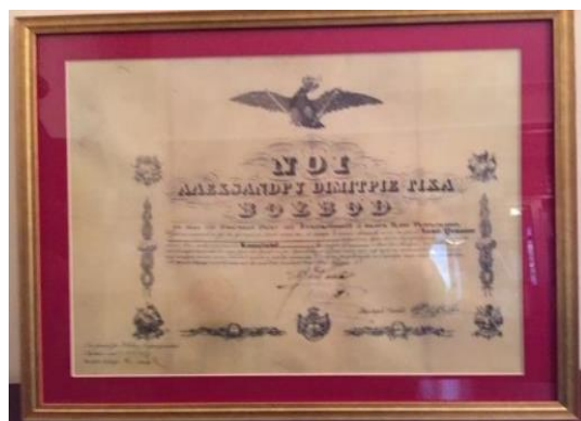
Fig. 3 Diplomas on modern parchments