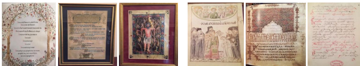
Fig.4 Reproductions of historical documents on parchment, MNIR